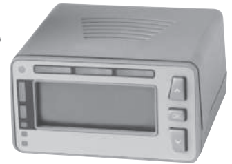
Driver Interface Unit (DIU)

The Bendix VORAD VS-400 System is available as a factory-installed option and through the aftermarket as a retrofit system for trucks, transit buses and coaches.