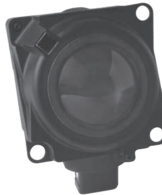
Bendix™ SmartCruise® Forward-Looking Radar

The Bendix SmartCruise adaptive cruise control is integrated with the radar and automatically adjusts vehicle speed by reducing the throttle and engaging the engine retarder to help drivers maintain a safe following distance. (NOTE: Bendix SmartCruise does NOT apply the vehicle brakes.)