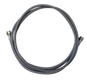
72" Coax Cable