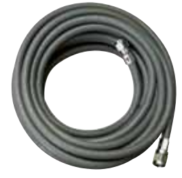
20' Coax Cable