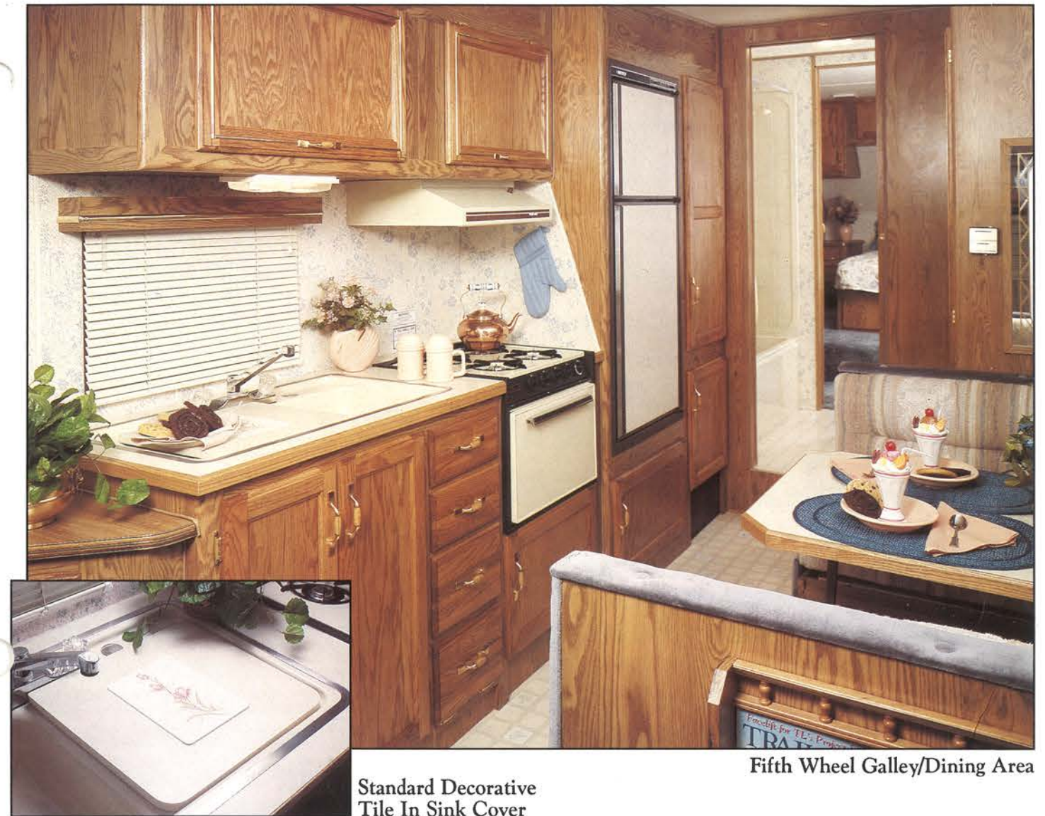
Fifth Wheel Galley/Dining Area