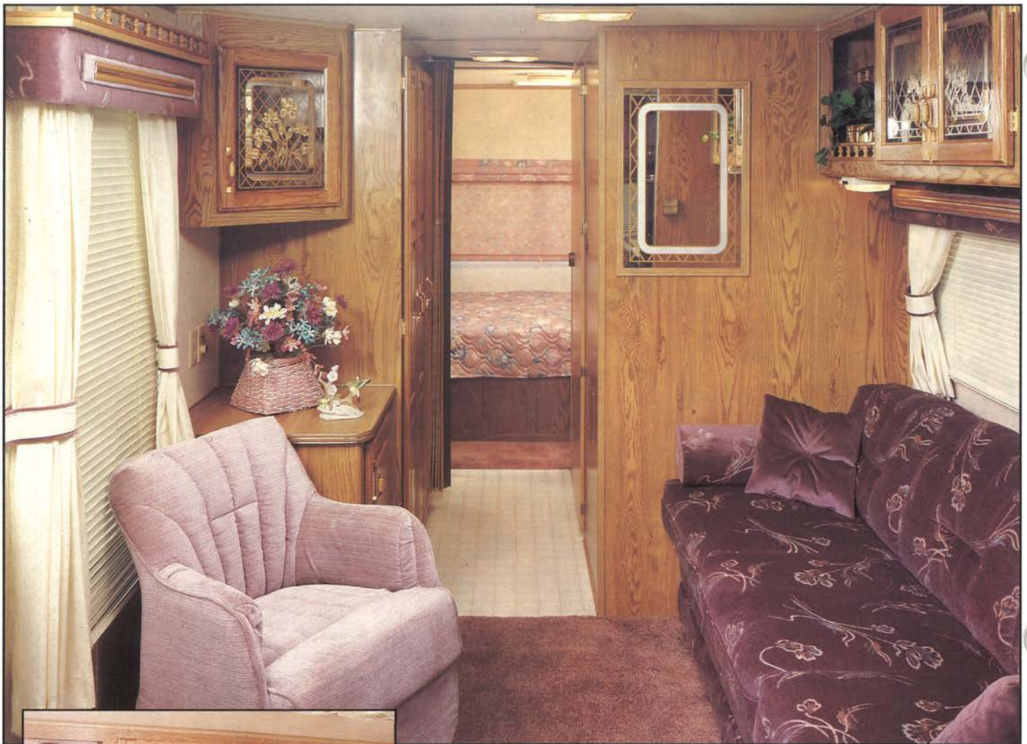
Optional XL Package