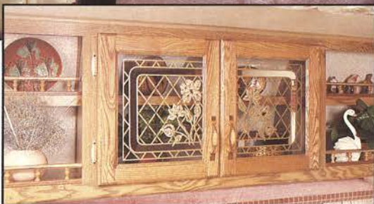
Standard Etched Glass In Overhead