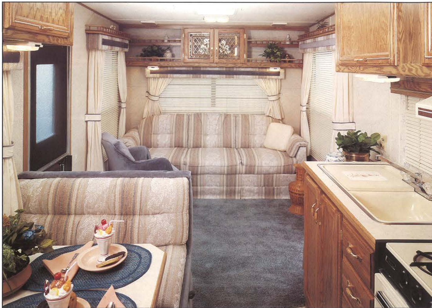
Fifth Wheel Living Area