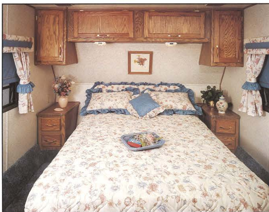
Fifth Wheel Bedroom