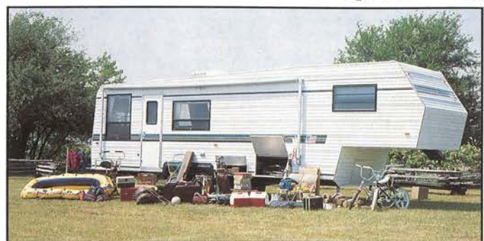
Super Storage Model

"Don't forget to check out the Klub... the Newmar Kountry Klub that is. All you need to be eligible is to be the proud owner of any one of the fine Newmar products!"