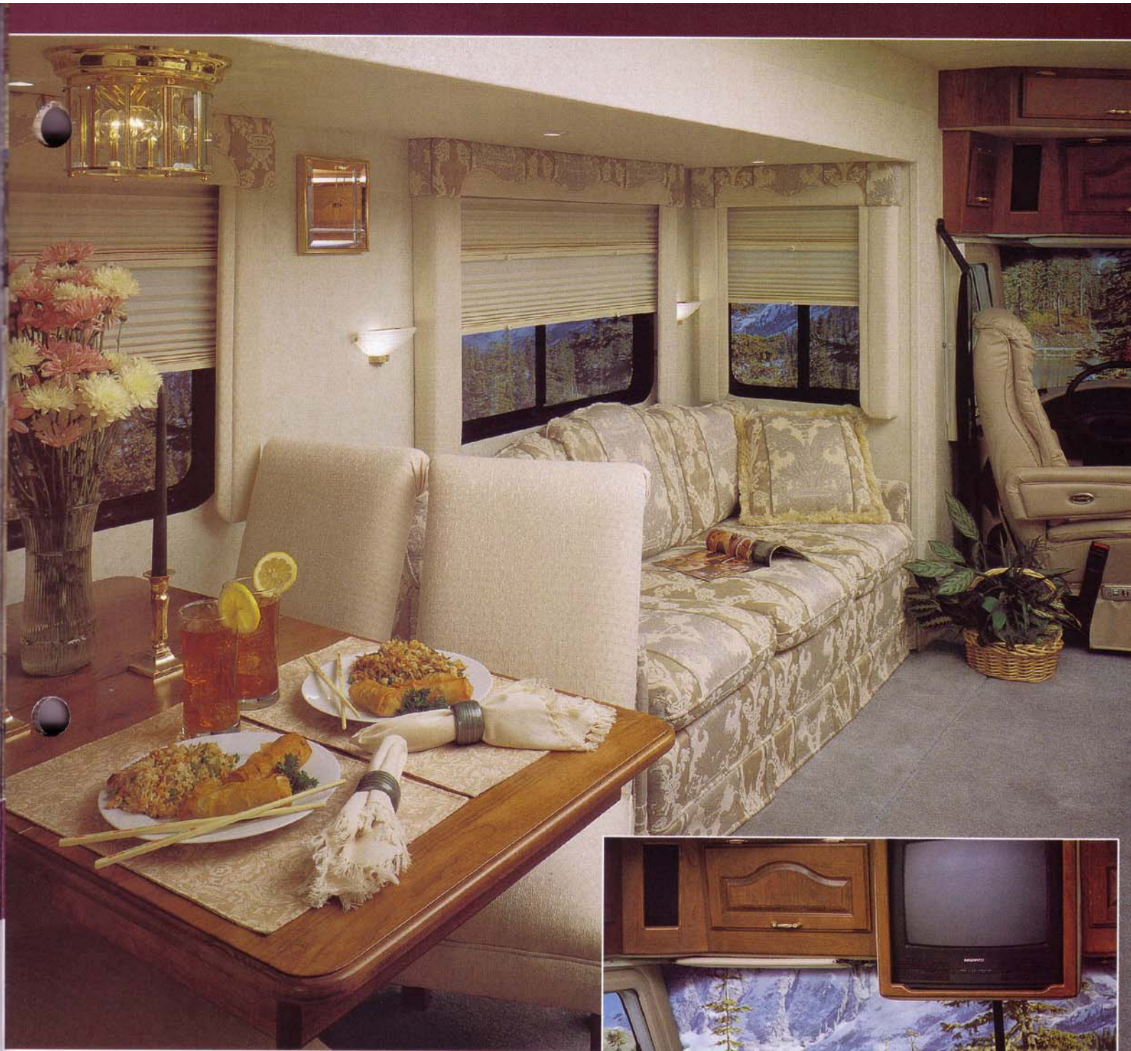
The formal living area of the Kountry Aire®, with the patented, flat floor slideout feature, is perfect for entertaining guests or for family fun.