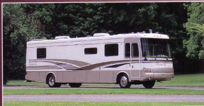
1997 Mountain Aire® Diesel Pusher.