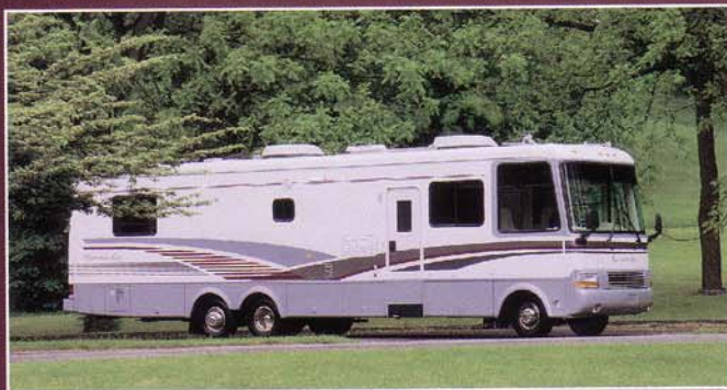
1997 Mountain Aire®