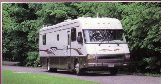
1997 Kountry Aire® Diesel Pusher.

Plant Tours Beginning at 10:00 a.m. & 1:00 p.m., Monday-Friday.