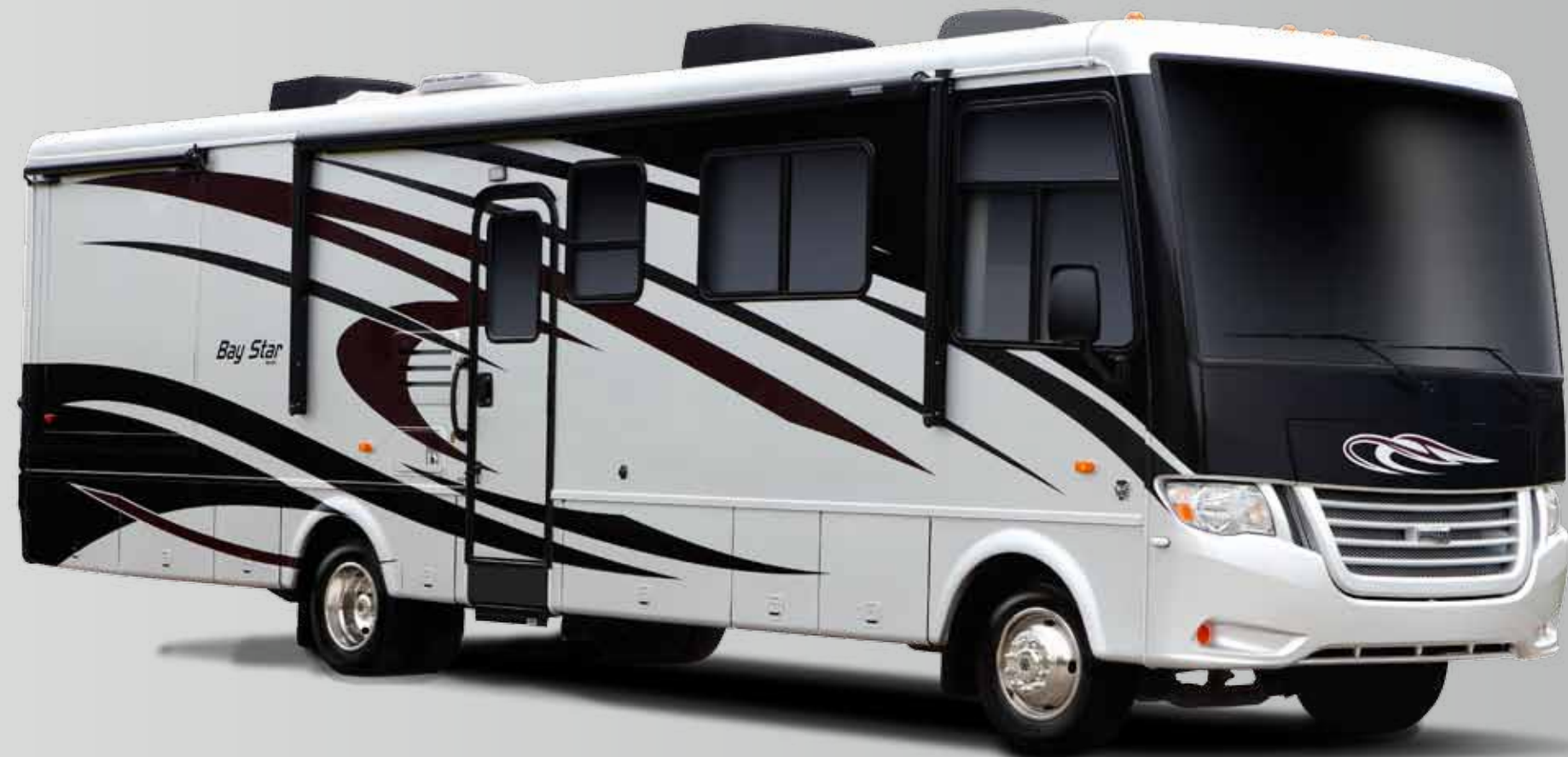
MIDNIGHT MIST EXTERIOR PAINT

Newmar is known for its exquisite diesel motor coaches. Yet with gas coaches like the 2012 Bay Star, packed with extras you'd expect from a far more expensive coach, heads are turning. You have to experience the all new Bay Star's many extra touches to believe it.