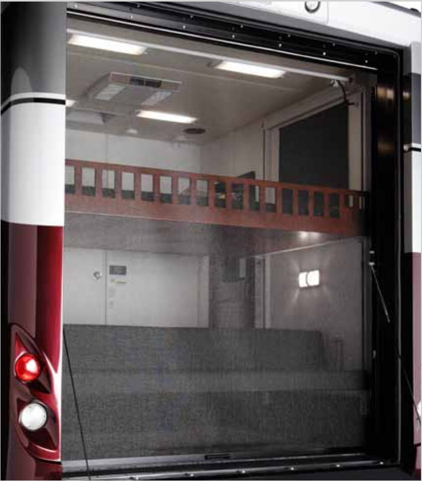
TOY HAULER FLOOR PLAN Most toy haulers don’t offer a fixed queen size bed like Canyon Star.