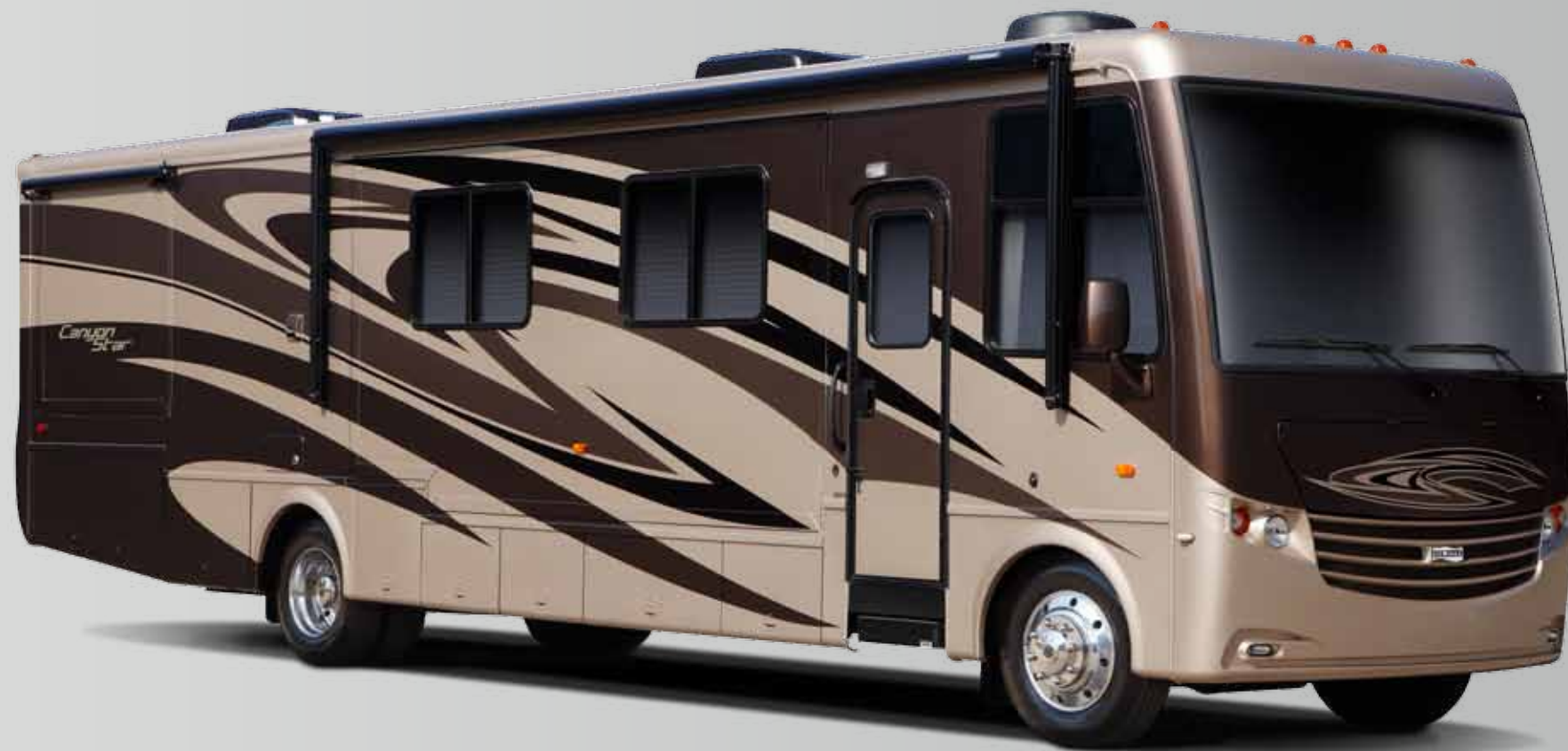
TRUFFLE EXTERIOR PAINT

With the 2012 Canyon Star, you get a traveling entertainment suite – or a home with a garage – or a two bedroom home. Canyon Star's amazingly wide range of smart floor plans lets you choose the lifestyle that's right for you.