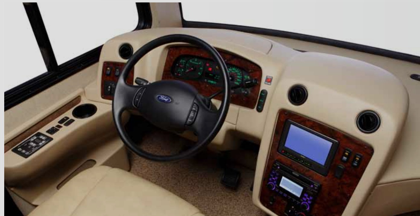
EASY, COMFORTABLE DRIVING