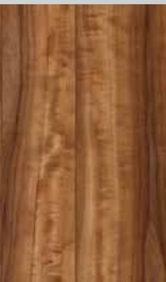
Monteray Maple Flooring Option