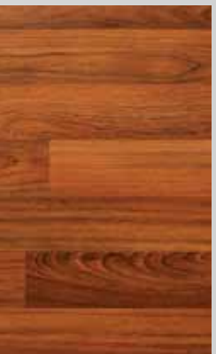
Empire Maple Flooring Option