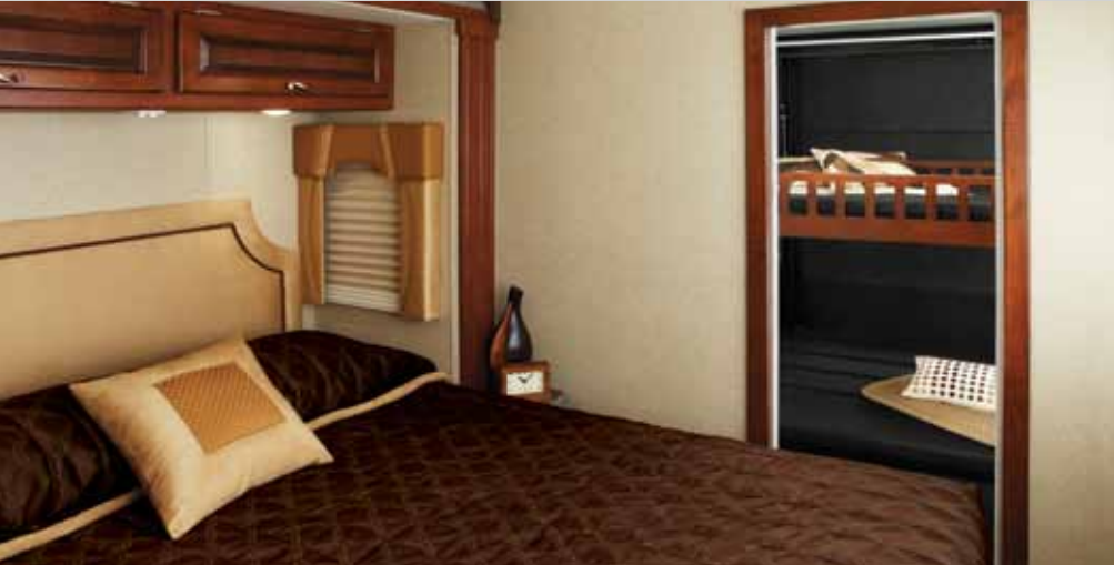
BEDROOM WITH REAR BUNK

With a pull-down bunk bed,you can turn Canyon Star’s rear garage into a kid-friendly bunk room at a moment’s notice. Or a handy place to store your favorite toys – like bikes or 4-wheelers.Some Canyon Star owners have used the garage as an exercise room,a hobby studio or a pet bedroom. Its handy master bedroom entrance makes it accessible. Its roominess makes it practical.