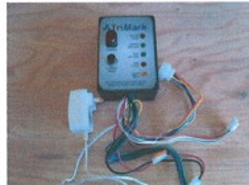
TM Keypad Test Box

This new keypad test box will help save your technicians diagnostic time and eliminate a costly error on misdiagnosing a component failure from a wire harness connection. The tool is designed to check all functions of the keyless entry “power – entry door lock or unlock – bay door unlock or lock – doorbell” with easy to follow illustrated instructions (see attachment).