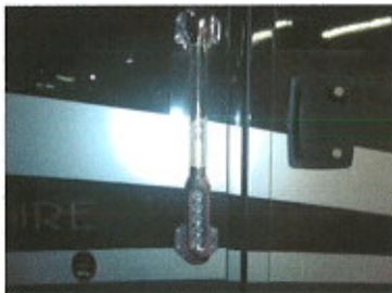
Keyless entry grab handle

A new test tool is available for the TriMark Keyless Entry Grab Handle