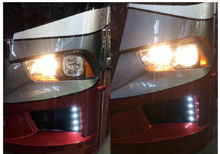
Marker Lights and Headlights on high beam before the harnesses are installed (left) and after the harnesses are installed (right).