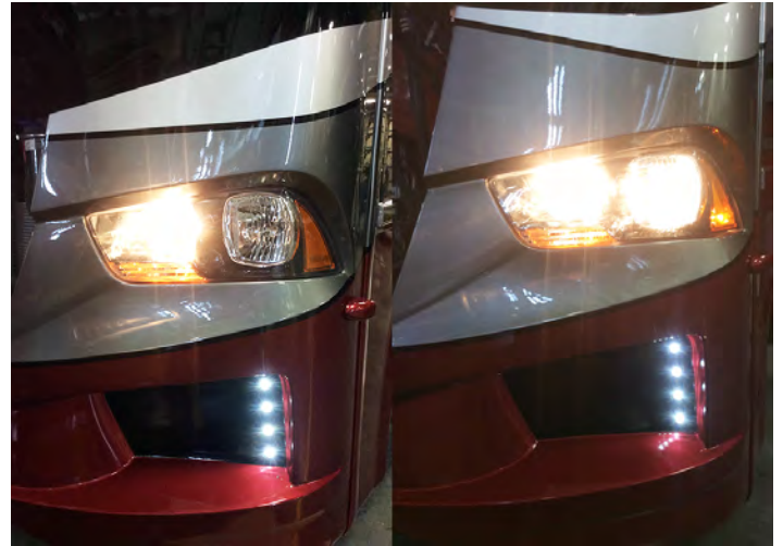
Marker Lights and Headlights on high beam before the harnesses are installed (left) and after the harnesses are installed (right).

Recall 17V 797: The front side marker lights are not connected into the wiring harness. When the headlight high beams are activated, only the high beam bulbs illuminate. The intention of the high beam function on the affected coaches is to have both the high beam and low beam bulbs illuminate together.