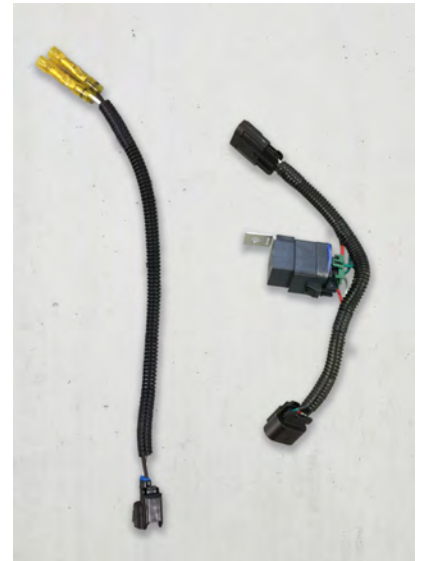
New Marker Light Harness (Left) and Headlight Harness with Relay (Right)