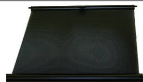
MCD Screen Door Pull-up Shade

Note: You will see at the top of the photo the night shade which is mounted to the coach wall and is a separate product from the Screen Door Pull-up Shade. The Screen Door Shade attaches to the door and moves with the door for ease of exiting/entering.