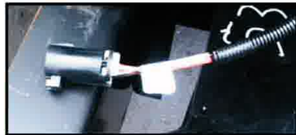
HWH INTERFACE CONNECTOR