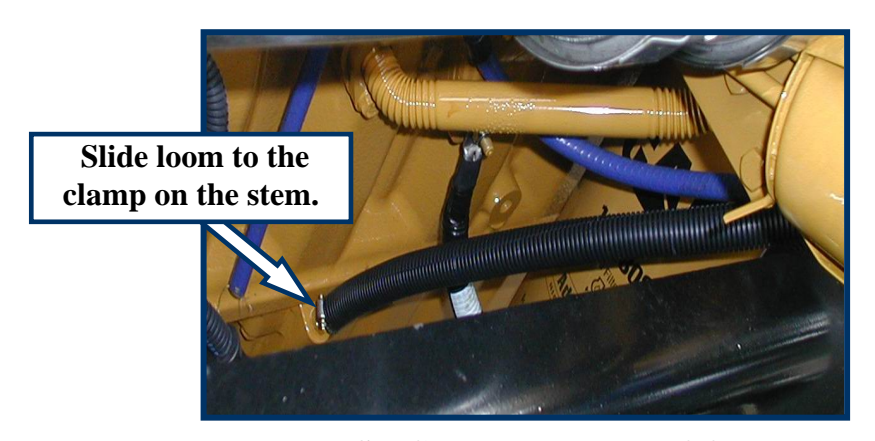
DIPSTICK TUBE WITH LOOM FIG. 3-2

7. Refer to FIG. 3-2. Install loom over dipstick tube, sliding it down to the clamp on the stem.